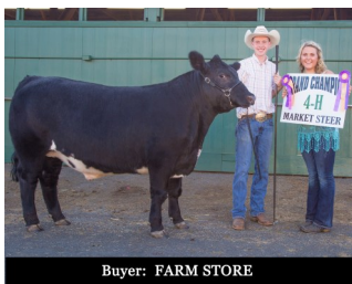
Buyer: FARM STORE

Thank you to all of our Buyers and Supporters!