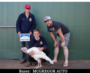
Buyer: MCGREGOR AUTO