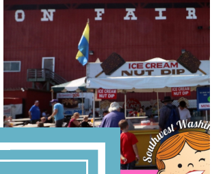
GUST 13-18, 2019 SouthwestWashingtonFair.org

ppy as a hen, COME CELEBRATE #48 ICE CREAM NUT DIP