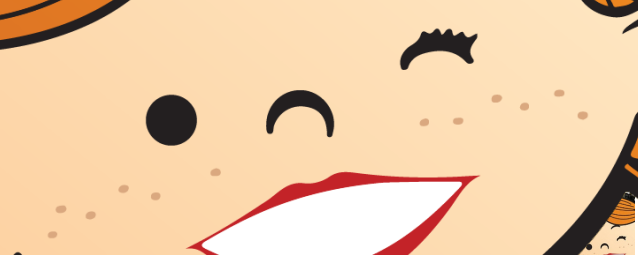
GUST 13-18, 2019 SouthwestWashingtonFair.org

ppy as a hen, COME CELEBRATE -WATCH THE DIAPER DERBY