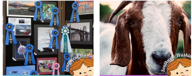
GUST 13-18, 2019 SouthwestWashingtonFair.org

ppy as a hen, COME CELEBRATE #72 - VISIT THE PHOTO BARN