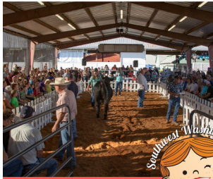
GUST 13-18, 2019 SouthwestWashingtonFair.org

ppy as a hen, COME CELEBRATE #70 - BUY A COW