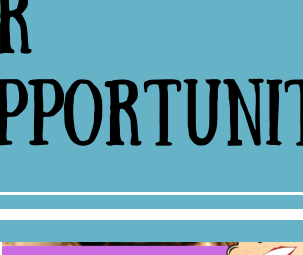
GUST 13-18, 2019 SouthwestWashingtonFair.org

ppy as a hen, COME CELEBRATE # FARM BUREA