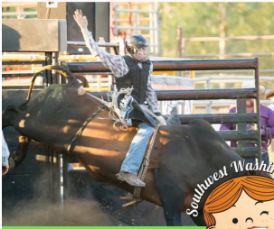
GUST 13-18, 2019 SouthwestWashingtonFair.org

ppy as a hen, COME CELEBRATE #74 - RIDE IN THE RODEO