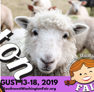
GUST 13-18, 2019 SouthwestWashingtonFair.org