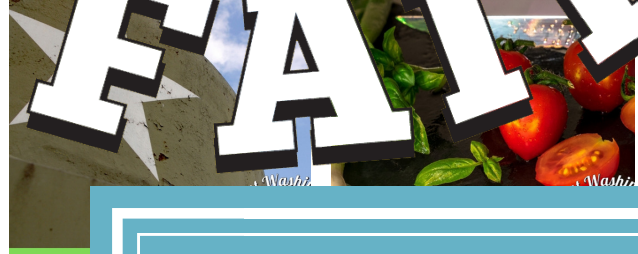
GUST 13-18, 2019 SouthwestWashingtonFair.org

ppy as a hen, COME CELEBRATE #53 - ARMY BOOTH #24 - MONS TAKE A TRIP TO THE 60'S