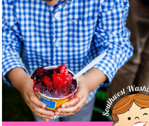
GUST 13-18, 2019 SouthwestWashingtonFair.org

ppy as a hen, COME CELEBRATE #27 - COOL OFF WITH A SNO CON