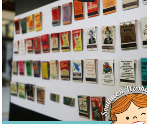
GUST 13-18, 2019 SouthwestWashingtonFair.org

ppy as a hen, COME CELEBRATE #23 FLOW HOBBY