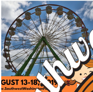
GUST 13-18, 2019 SouthwestWashingtonFair.org

CATCH A RIDE ON THE FERRIS WH 9 - FUTURE FARMERS OF AMERICA #7 - DEMOLITION DERBY #33 - MUTTON BUSTIN' 4 - WATERMELON EATING CONTE