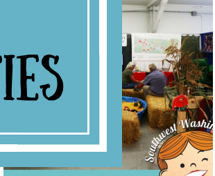
GUST 13-18, 2019 SouthwestWashingtonFair.org

ppy as a hen, COME CELEBRATE # FARM BUREA