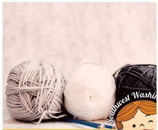
GUST 13-18, 2019 SouthwestWashingtonFair.org

ppy as a hen, COME CELEBRATE #52 - KNITTING DEMONSTRATION