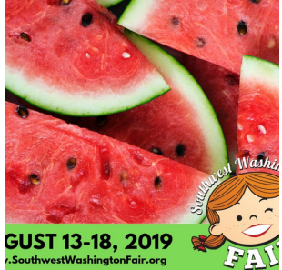
GUST 13-18, 2019 SouthwestWashingtonFair.org