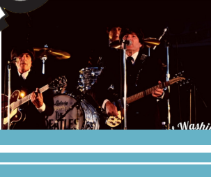
GUST 13-18, 2019 SouthwestWashingtonFair.org

ppy as a hen, COME CELEBRATE #48 ICE CREAM NUT DIP