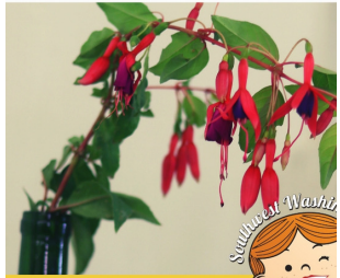
GUST 13-18, 2019 SouthwestWashingtonFair.org

ppy as a hen, COME CELEBRATE #59 - FUSCHIA BLOOMS