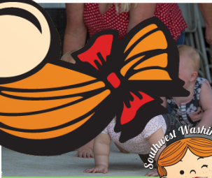
GUST 13-18, 2019 SouthwestWashingtonFair.org

ppy as a hen, COME CELEBRATE #52 - KNITTING DEMONSTRATION