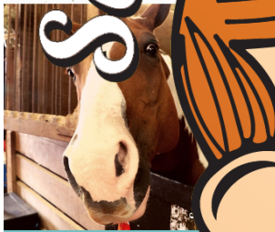
GUST 13-18, 2019 SouthwestWashingtonFair.org

ppy as a hen, COME CELEBRATE -WATCH THE DIAPER DERBY