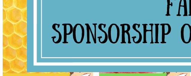
GUST 13-18, 2019 SouthwestWashingtonFair.org